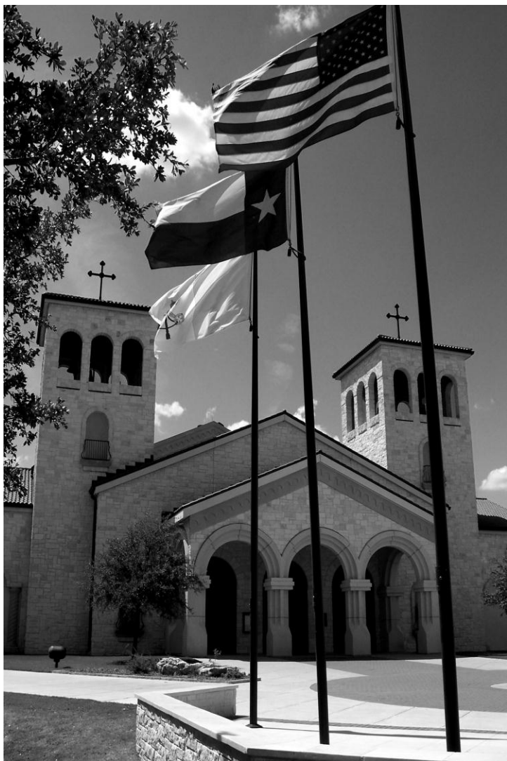
St. William Catholic Church September 2011